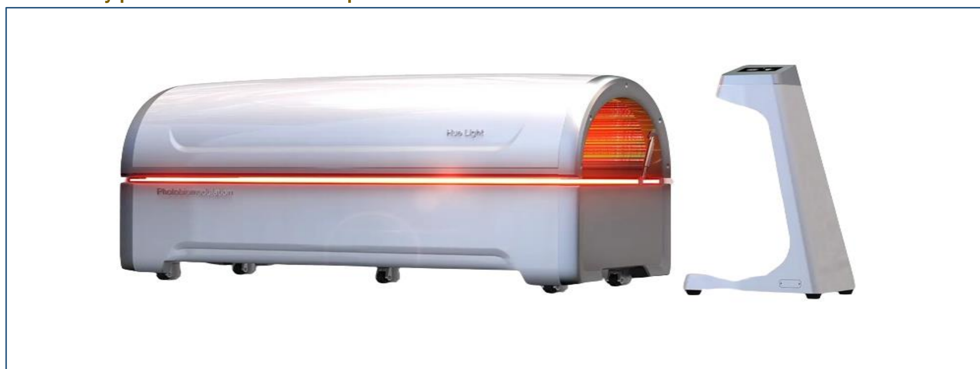
Figure 2. Whole-body photobiomodulation therapy device used in the study