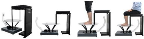
Figure 1. 3-D scanner and its application

We enrolled participants based on following criteria; being 18 years or older, experiencing foot pain or discomfort lasting at least four weeks, and having no history of lower limb surgery or fractures in the past year. Exclusion criteria included pregnancy, use of medications that may affect foot function or mobility, history of neurological disorders affecting the lower limbs, and presence of open sores, wounds, or infections on the feet. All participants were provided with custom-made insoles created using 3-D scanning and printing technology to alleviate their foot discomfort or pain.