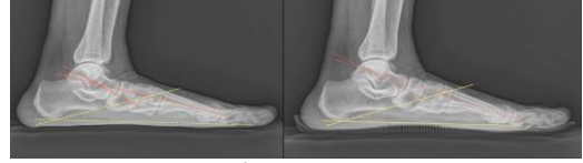
Figure 4. Radiographic analysis: the left image presents without the insole, and the right image shows with the insole. Red dotted line: Meary's angle, Yellow dotted line: Calcaneal pitch angle.