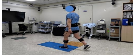
Figure 3. Gait analysis

To compare the effectiveness of these custom-made insoles, we conducted gait analysis and radiologic examination twice, once with the custom-made insoles and once with conventional insoles. During the gait analysis, we examined spatiotemporal parameters and kinematic parameters, while in foot radiology, we measured Meary's angle, Calcaneal pitch angle, and Navicular coverage angle. The participants' subjective foot pain or discomfort was measured using a Patient-Reported Outcome Measure (PROM) and was expressed on a Numeric Rating Scale (NRS).