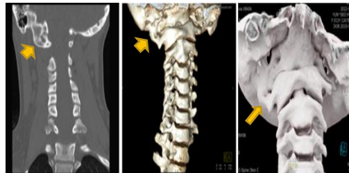
Figure 3. Three dimensional computed tomography images of cervicovertebral junction. Occipital bone and paracondylar process makes pseudoarthrosis but there is no rotatory atlantoaxial subluxation.