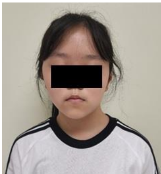
Figure 1. Head posture tilted to left side and translated to right side.